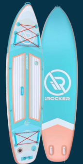
THE CLASSIC CRUISER ULTRA

For confident, solo riders who enjoy the thrill of speed.