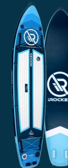
ADVENTURE SERIES ALL-AROUND 11' ULTRA

Versatile performance with a mix of speed and maneuverability.