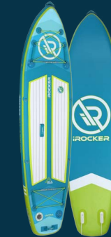
ADVENTURE SERIES ALL-AROUND 10' ULTRA

A lightweight, stable, and premium board for all riders.