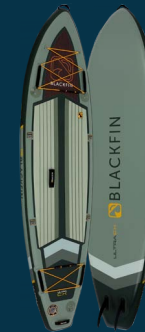
THE SPECIALIST BLACKFIN CX ULTRA

With something for everyone, this collection takes the sup experience to the next level.